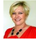
operate the café in the Citrus County Resource Center in Lecanto.